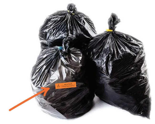
Visit creston.ca for more info on waste.

We all have extra waste sometimes. If this is the case, EXTRA Bag Tags are available at Town Hall for $2 each. Simply place the EXTRA Bag Tag on your extra waste bag that weighs no more than 25lbs, and it will be picked up. Without a Bag Tag, waste over the quantities outlined in Creston's Bylaw No. 1959 will be left behind.